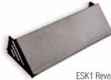
ESK1 Reversible Shelf (Literature)