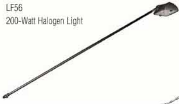
LF56 200-Watt Halogen Light