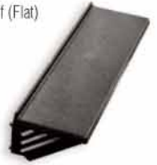
ESK1 Reversible Shelf (Flat)

Innovative accessories allow you to customize your Evolution display. Backwall cabinets, podiums and counters provide valuable storage and countertop space. Lighted product display boxes bring extra attention to your special products. Your Authorized ExpoDisplays Distributor will help choose the accessories needed for a functional and effective display.