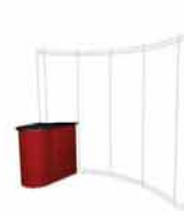
EBC35 Backwall Cabinet