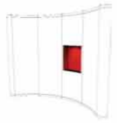
PDSK4 Shadow Box